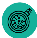
Finance & Risk Management